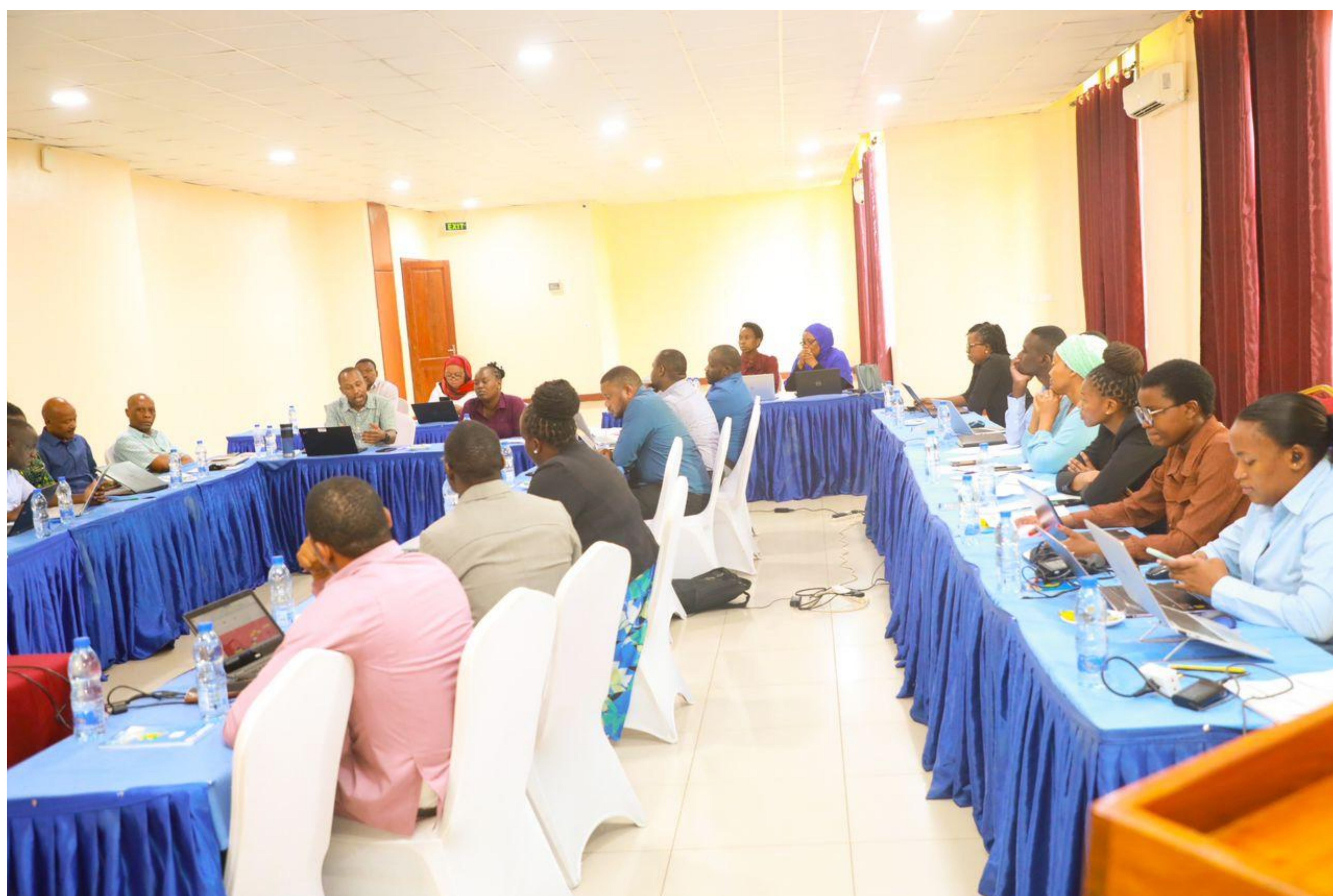
Discussion of assessment findings to the Technical Workgroup meeting